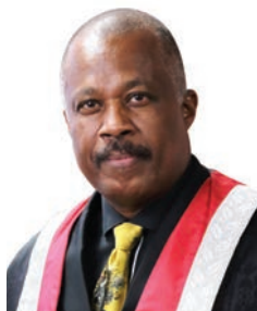
Professor Sir Hilary Beckles

Vice-Chancellor, The University of the West Indies